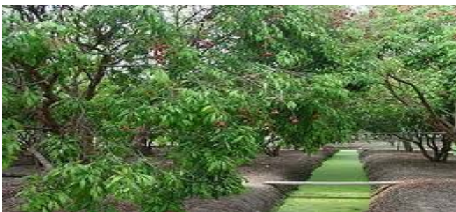
Fig. 4 Agriculture Area