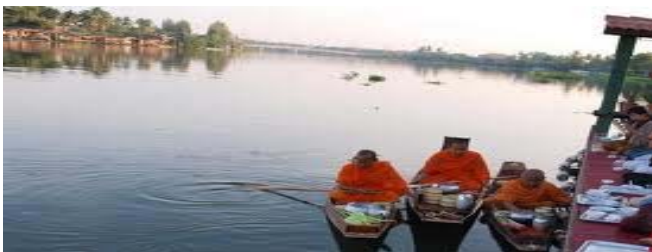
Fig. 3 Morning Culture