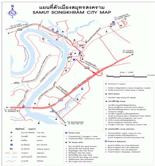
Fig. 1 Map of Bang Khonthi Samut Songkram