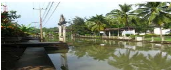
Fig. 2 Environment in Bang Khonthi