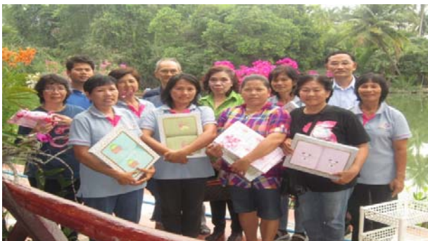
Fig. 7 Ruk Bang Khonthi group

We have suggestions in two main aspects which are a policy and a suggestion for the entrepreneurs of the resort in Bang Khonthi district, Samut Songkram. A suggestion regarding the policy for Bang Khonthi district including the whole province of Samut Songkram is that there must be a support for an ecotourism which emphasizes arts, culture, and the beauty of the way of life. Also, the nature must be preserved by raising more awareness of tourists towards its importance to all life on earth. The local people should be encouraged to form a network such as Ruk Bang Khonthi group which lets them share opinions and help one another. Eventually, this will lead to a learning process and an experience accumulation. In order to develop the tourism in this particular area, the policy should not be done hurriedly or by comparing with others. The main goal is to let everybody become involve and thoroughly have them experience the most out of the development. Hence, it can be said that living in accordance with the philosophy of sustainable economy is one approach leading to a real strong community as people are always reminded of a cautious life.