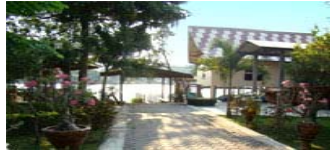
Fig. 5 Lodging in Bang Khonthi